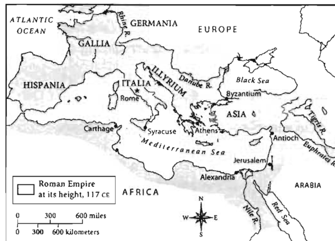
The Roman Empire at its height

Your task is to examine the documents in this Mini-Q and decide which three problems were most responsible for bringing Rome to its knees. Then, of these three problems, decide which was most important.