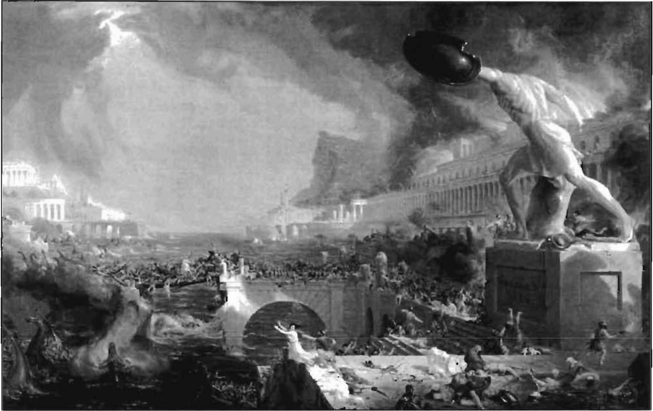
The Destruction of Empire , painted by the American artist Thomas Cole in 1836.

Overview: From about 50 BCE until the year 200 CE, the Roman Empire was the superpower of the Mediterranean world. During that time, the empire's wealth, territory and international status grew and grew. But even as the empire prospered, it was slowly starting to fall apart. Some of its problems were internal – coming from within Rome itself – and others were external. This Mini-Q explores the factors that led to the eventual fall of one of history's most powerful and influential empires.